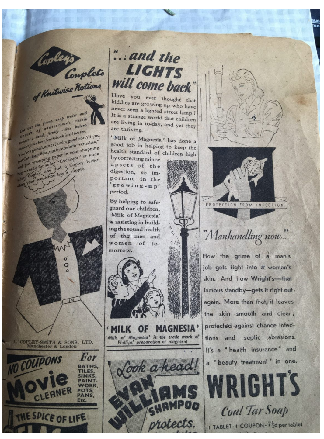
Figure 2. During the Second World War, light's return was anticipated eagerly, its absence created strangeness. (Source: Advert for Milk of Magnesia, in Home Notes , 1943.)