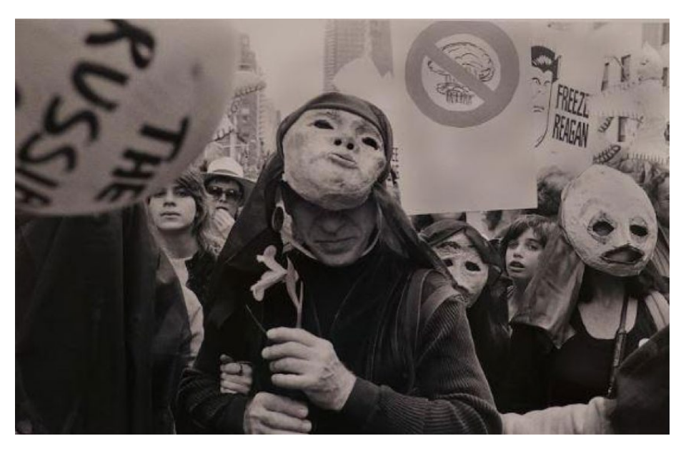
Figure 3. Gary Schoichet. Protestors at Anti-Nuclear Rally, New York, New York. 12 June 1982. Archival print. 16 x 20 inches.

Moving through the exhibit, the crayon drawings by child survivors of Hiroshima have been preserved by the All Souls Unitarian Church of Washington, D.C. and