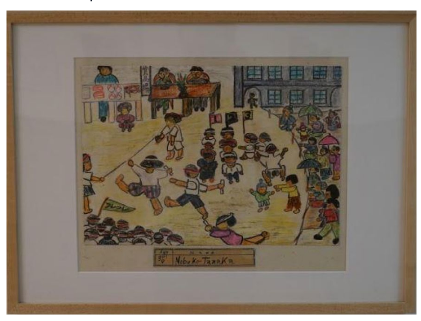
Figure 4. All Souls Unitarian Church, Washington D.C. Children's Drawings Collection. Drawing by Nobu-Ko Tanaka, age nine.

curated by Melvin Hardy. These prints are labeled with the name, age, and gender of each artist, marking these individual aesthetic studies as an anthropological tracing of the effect of world events on children. This collection of drawings offers a glimpse into the thoughts, interests, and dreams of young people whose lives were irrevocably changed by the denotations over Japan. The displayed images that the children, ranging in age from six to twelve, drew include a variety of urban and schoolyard scenes, as well as landscape studies and floral still life sketches.