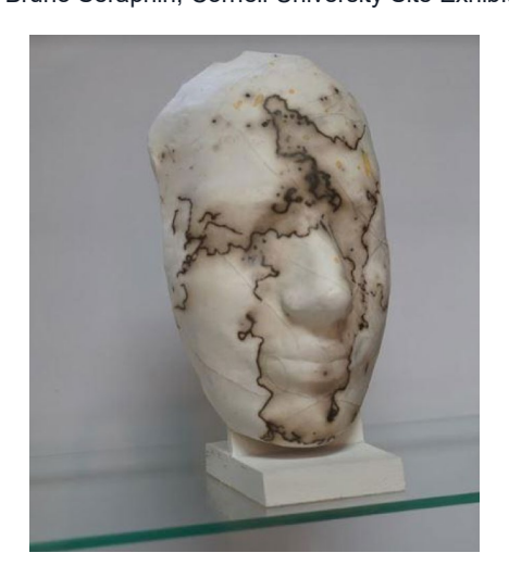
Figure 5. Marion Held. 7 x 5 x 3.5 inches. Clay with glaze. 2017. Installed at Anabel Taylor Hall, Cornell University, 2018.