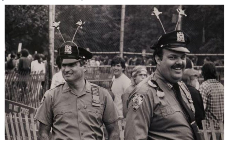
Figure 2. Gary Schoichet. Police at Anti-Nuclear Rally, New York, New York. 12 June 1982. Archival print. 16 x 20 inches.

organized as part of the Reppy Institute's "Paths to Peace" project. Forsberg's newly published book, Toward a Theory of Peace (2018) is available online at https://einaudi.manifoldapp.org/projects/toward-a-theory-of-peace; a print copy is forthcoming from Cornell University Press.