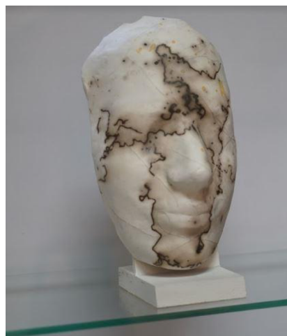
Figure 5. Marion Held. 7 x 5 x 3.5 inches. Clay with glaze. 2017. Installed at Anabel Taylor Hall, Cornell University, 2018.