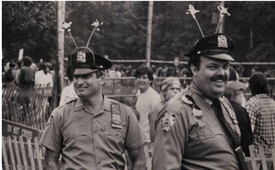
Figure 2. Gary Schoichet. Police at Anti-Nuclear Rally, New York, New York. 12 June 1982. Archival print. 16 x 20 inches.

organized as part of the Reppy Institute's "Paths to Peace" project. Forsberg's newly published book, Toward a Theory of Peace (2018) is available online at https://einaudi.manifoldapp.org/projects/toward-a-theory-of-peace ; a print copy is forthcoming from Cornell University Press.