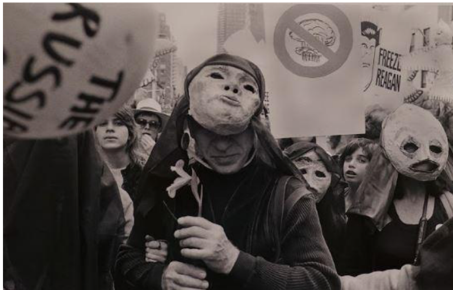
Figure 3. Gary Schoichet. Protestors at Anti-Nuclear Rally, New York, New York. 12 June 1982. Archival print. 16 x 20 inches.

Moving through the exhibit, the crayon drawings by child survivors of Hiroshima have been preserved by the All Souls Unitarian Church of Washington, D.C. and