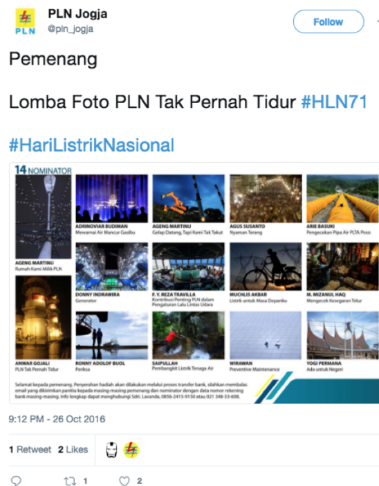
Figure 4. Tweet announcing 2016 Photo Contest

In October 2016, the electricity company held another photo contest with a theme “PLN Tidak Pernah Tidur” (PLN Never Sleeps). The 14 winning entries were tweeted by a PLN branch office in Jogjakarta (See figure 4).