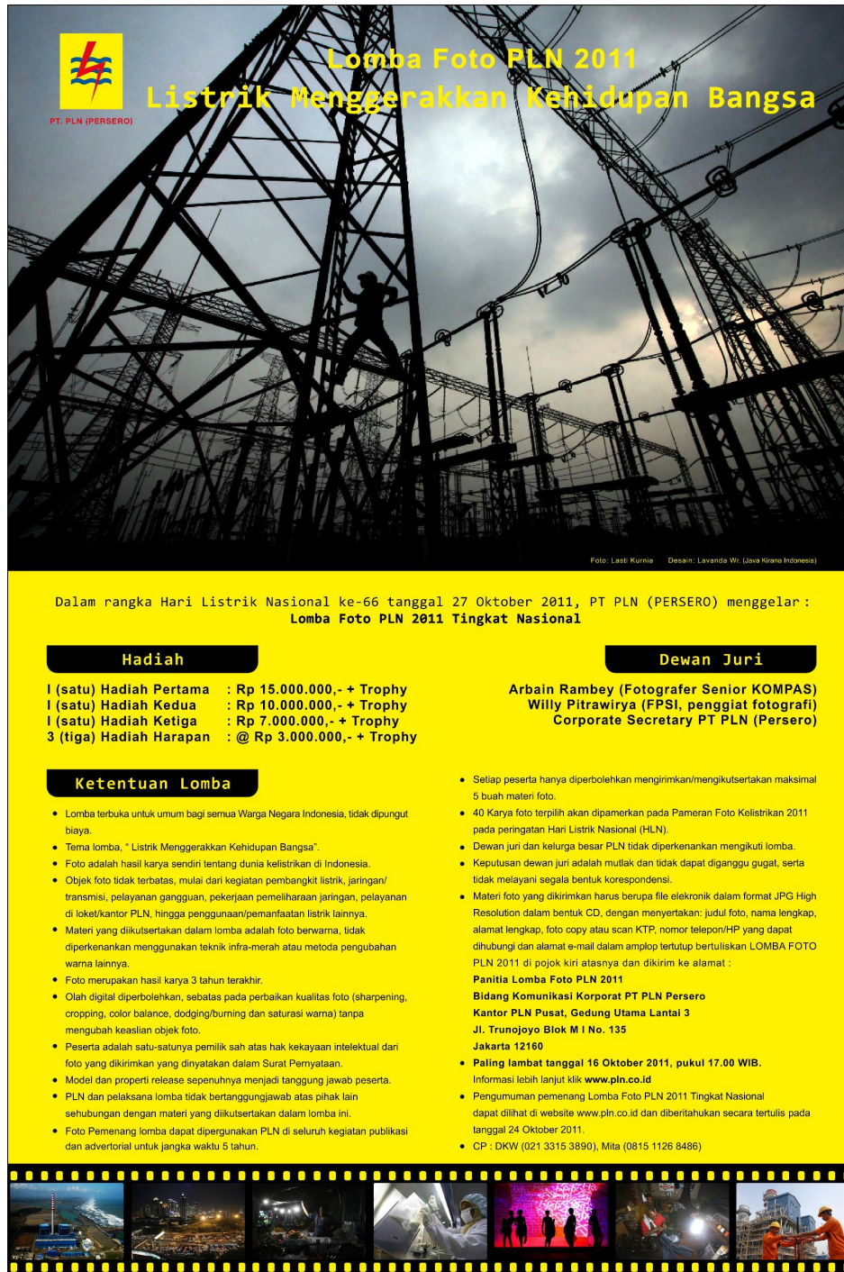
Figure 1. 2011 PT PLN Photo Contest Announcement

Life of the Nation” (see Figure 1), attracted 650 participants with more than 2500 submitted images. 10