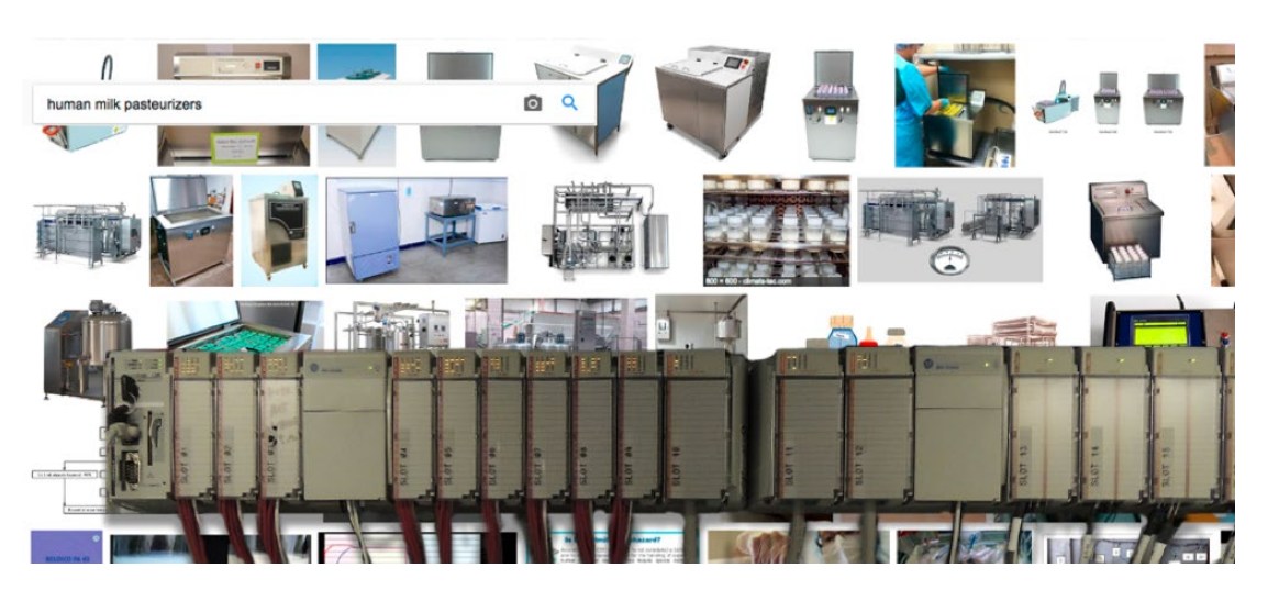
Figure 4. Montage of human milk pasteurizers and programmable logic controllers.

Sometimes, solutions are not directly based in advanced science. In a public hospital in the Uruguayan countryside, a process based on the solidarity of breast-feeding mothers was organized with the aim of providing maternal milk for newborn