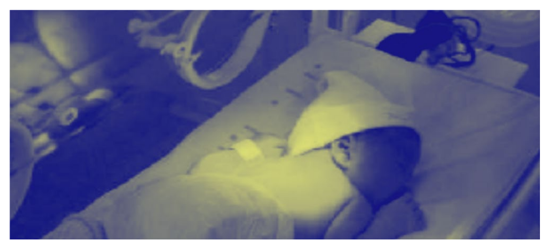
Figure 3. BibiLEDs used in Uruguayan public maternity wards.

Premature births are more prevalent among poor women, and especially among poor teenagers. Severe newborn jaundice is more prevalent among premature babies. The non-risky treatment of this problem consists of directing a beam of blue light of a very precise frequency into the baby's body, which allows the elimination of the molecules of bilirubin, the concentration of which causes the jaundice. Today, lamps with blue LEDs are used for this purpose, but these are expensive because they use thousands of LEDs. In the Uruguayan public maternity wards, where newborn jaundice is quite common, these lamps were unaffordable. A university researcher in physics, aware of the problem, proposed to add a light concentrator, which achieved the needed intensity with 10 percent of the previous number of LEDs. This made the lamp