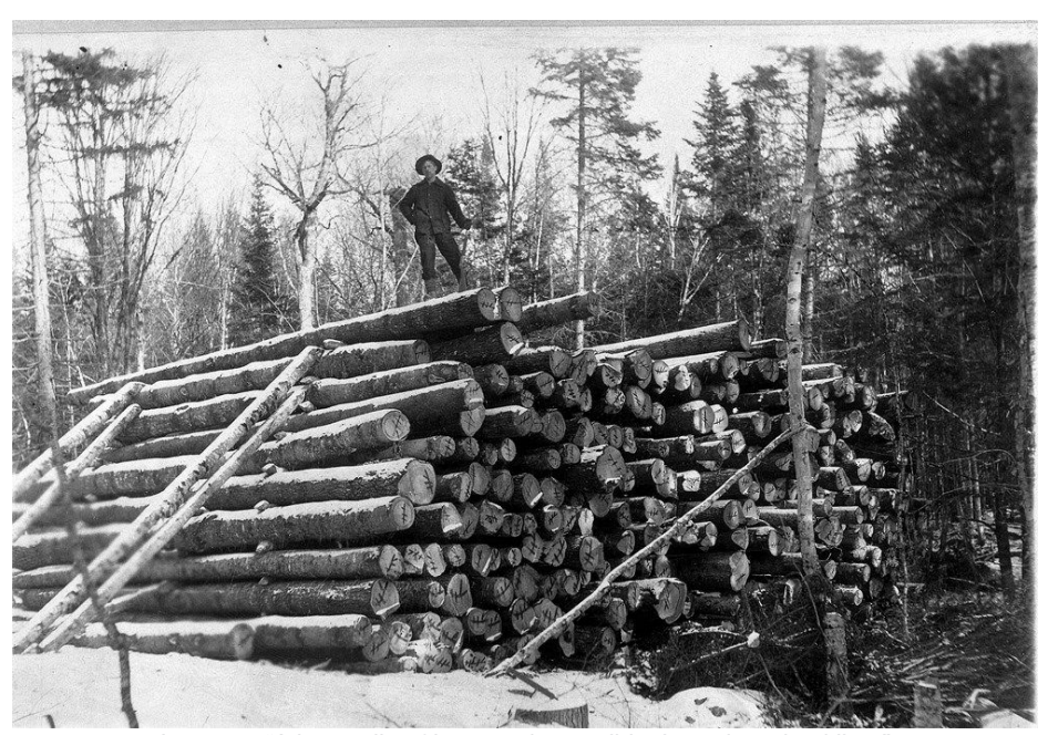
Image 8. "A large pile of logs made possible through parbuckling."

There were redundancies in the above method of storage and transportation, however. Time and resources were wasted building, loading, and unloading skidways and waiting for a snowpack. Probably around the first decades of the twentieth century, some unknown logger realized they could haul logs right after cutting. At strategic locations operators began to build one or two piles called the "hot yard" or "hot landing"