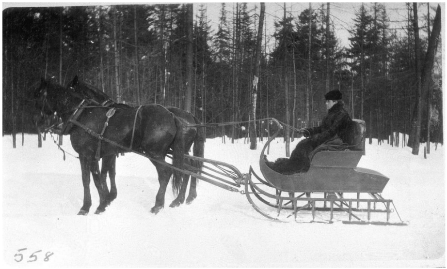
Image 3. Horse drawn sled.

In rural communities, people drew weighted rollers over roads compacting the snow making it slicker, sturdier, and longer lasting (image 2). Sleighs replaced wagons and horses were equipped with calked shoes (image 3). Snowball hammers removed accumulated ice and snow from horseshoes (image 4). City omnibuses and cable cars were retrofitted with runners. Utilization of snow continued for a long while in parts of the country. In Rochester, New York in 1917, city planners proposed keeping certain streets