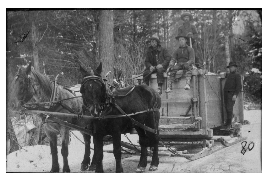
Image 1. "The sprinkler or watering box."

with materials at hand. Improvised spigots spread water as the sled moved in the dark of night, when temperatures were coldest. The roads were initially a quaint rural curiosity to Bird but their industrial nature became clear when she took a trip aboard a logging sled with a teamster. Bird wrote that she experienced a "numbing awe . . . [as] those tons of logs . . . were seemingly pushing us to perdition. This was not sport. It was a matter of life and death!" <sup>1</sup>