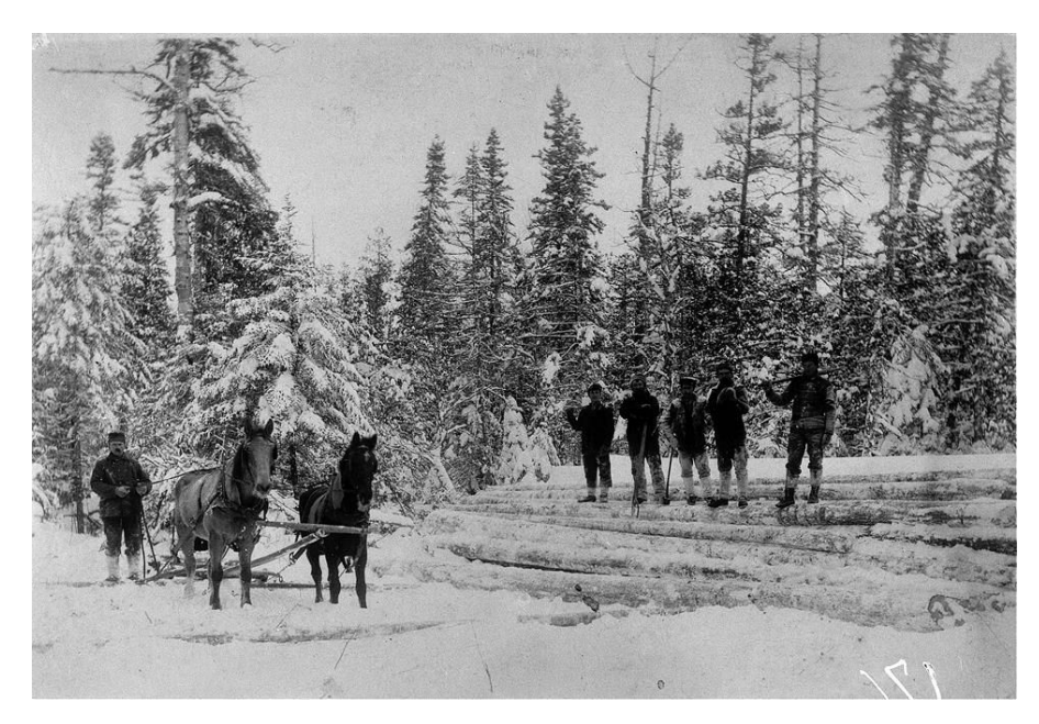
Image 7. "A short pile of logs."

The Winter Workscape - Newton January 2021