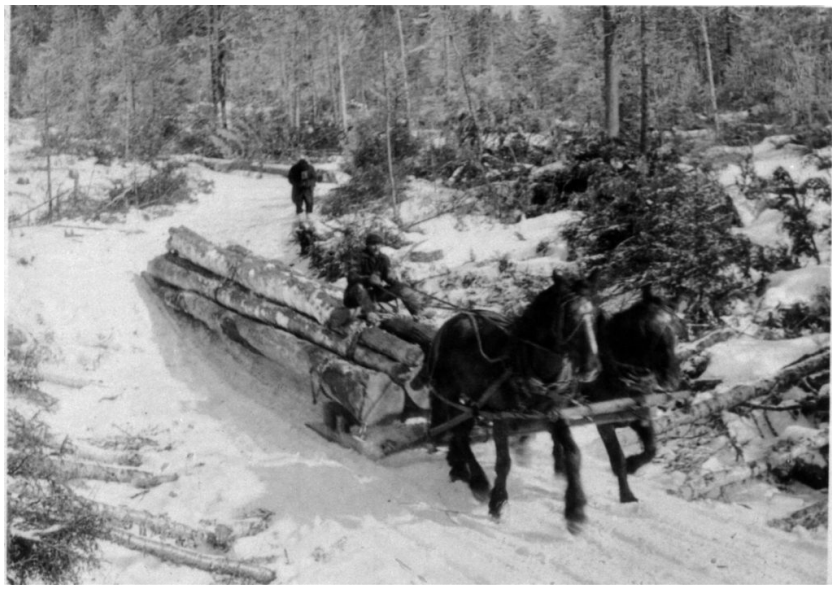
Image 6. "Speeding up the haul."

Snow was a benefit for loggers, but it also created problems. After cutting, logs or pulp wood was piled on skidways until a snowpack formed for the haul. Initially, logs were only piled high enough to be found after a snowfall because large piles were dangerous (image 7). Short piles meant skidways were spread over a larger area, and each of the numerous short piles needed to be shoveled before the haul. On large jobs, fewer, more dangerous skidways were preferred over larger numbers of skidways. Higher piling was done by "parbuckling" or "cross hauling." This required extra horses and extra workers but allowed skidways to be stacked 15 to 20 feet high (image 8). 19 Ice road maintenance and parbuckling show an increased division of labor in the woods, divisions made affordable to operators by cheap winter labor.