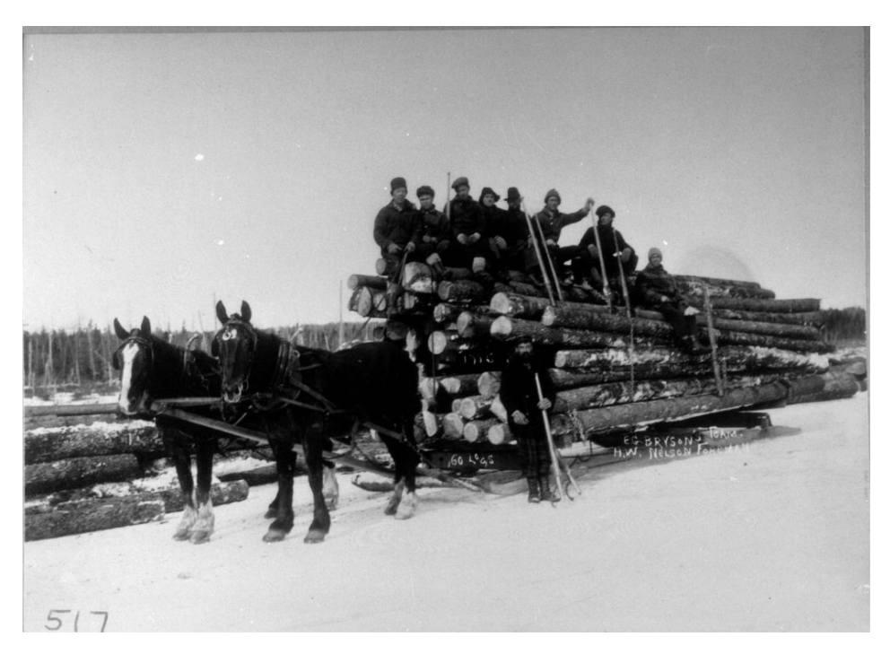
Image 5. "Heavy load of logs pulled on ice."

Ice also improved the ability of organic power sources to move heavy loads. Depending on the length of the haul, on unimproved snow roads alone a team could haul 700 to 1,000 board feet of lumber. In typical camps with improved ice roads "a four horse team could haul 5,000 to 8,000 board feet per load, while two horses can haul from 2,500 to 4,000 feet." Some "champion loads" were said to have weighed 70 tons (image 5). Lighter loads could be moved faster and with less difficulty (image 6).