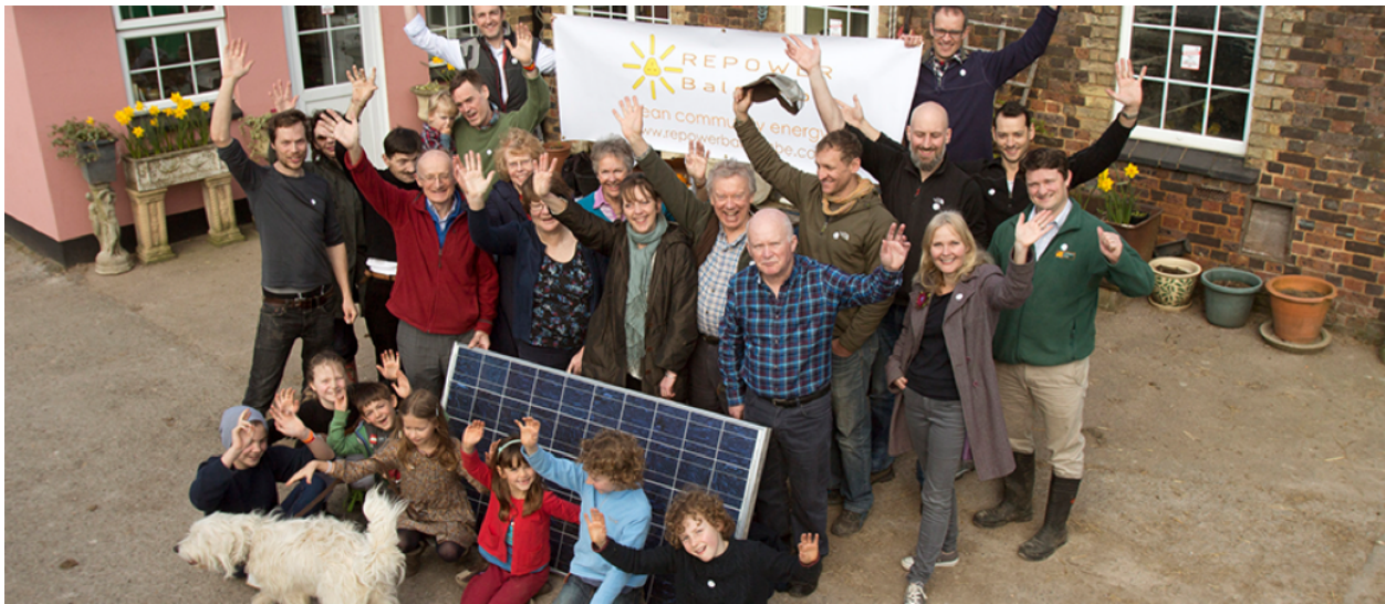
Figure 2. Repower Balcombe, an example of sustainable production pioneered by community and activist organizations in the English village of Balcombe.

Victorian philanthropism. 3 Nor are the enormous late twentieth-century gains in healthcare credibly explained without reference to the enabling effects of political pressures for welfare states. The currently burgeoning forms of renewable energy, sustainable agriculture and ecological production were likewise all pioneered by marginalized activist organizations—often strongly opposed by institutions associated with mainstream science and technology. 4 The rising interest in the importance of social and grassroots innovation as a means to help achieve social progress is informed by a current appreciation for the depth and extent of these real drivers of progressive directions for research and innovation. 5