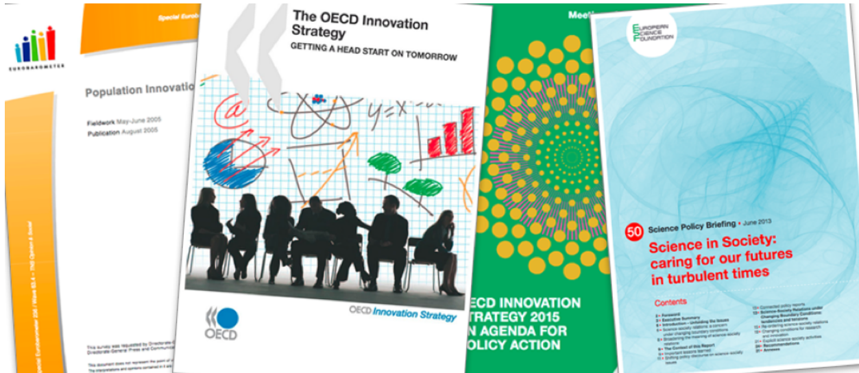
Figure 3. The language of innovation policies often neglect specifying which kinds of science, technology or innovation is being favored.

It is these attitudes from governments and businesses that encourage the routine branding of public reactions to a particular technology, such as GM crops or nuclear power, as “anti-science,” as if such responses represented an indiscriminate opposition to science in general. 12 This, again, entirely excludes the actuality that science and technology, like other kinds of institutional change, are branching evolutionary processes rather than a one-track race. 13 Just as market competition is held to favor the maximizing of economic performance, so political contestation in democratic societies might ideally help to steer the trajectories for science and technology in the most socially desirable directions. In this light, all the language and apparatus summarized here around supposedly generally “pro-innovation policies” or indiscriminately “anti-science” public reactions (the back and forth of “forging ahead” and “falling behind”) are