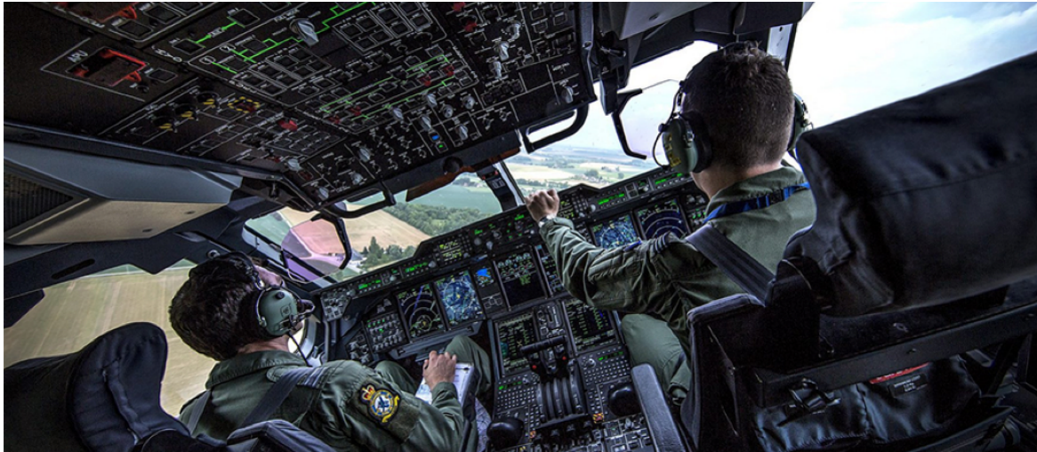
Figure 5. Cockpittism and new forms of environmental authoritarianism dismiss democracy as a luxury that should be put on hold.

order to address global warming. 25 Increasingly, the emphasized gravity and urgency of environmental challenges are held to demand moves towards new forms of “environmental authoritarianism,” 26 under which democracy is openly dismissed as a “luxury” that should be “put on hold.” 27