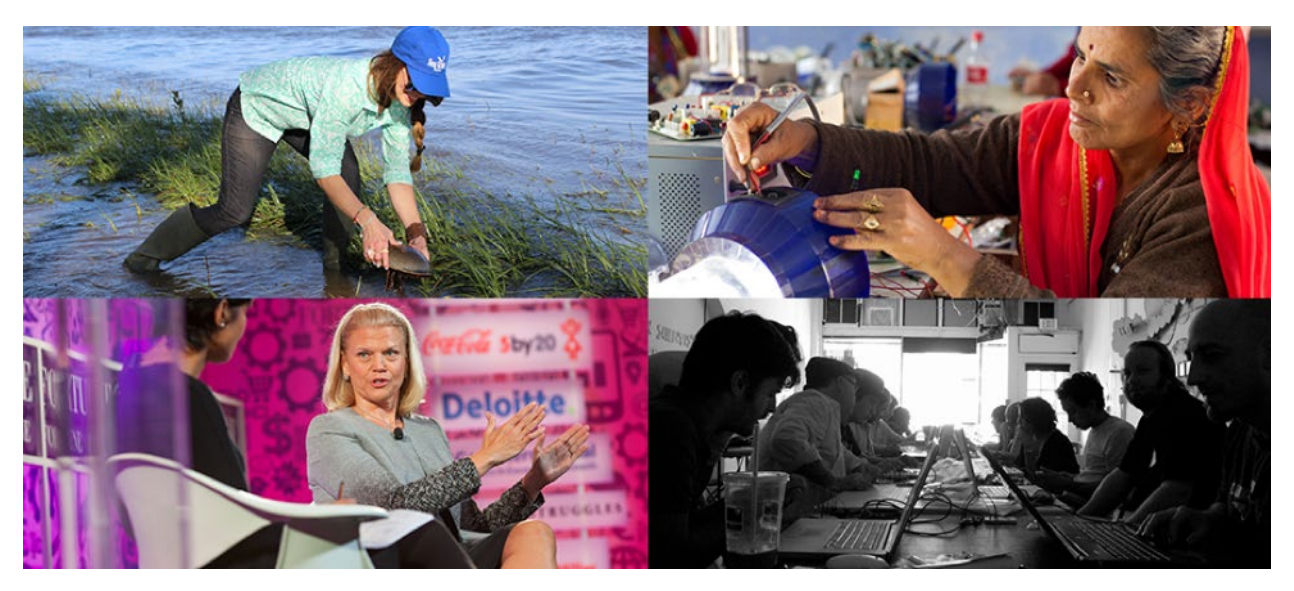
Figure 3. Science and technology advances through the work of many.

Ultimately, this way of telling stories recognizes the contribution of the many creators, carriers, and users of technology to social progress. So, for example, debating the efficacy of reports on the future of work can reveal a failure of imagination of experts who on the one hand are convinced the changing nature of work will lead to distress, but on the other see no reason to think the global capitalist system will fail to create new jobs. However, taking into account the perspective of a diverse set of people and a changing socio-technical configuration might reveal a different story entirely; a story for people for whom the present, let alone the future, is already far from okay.