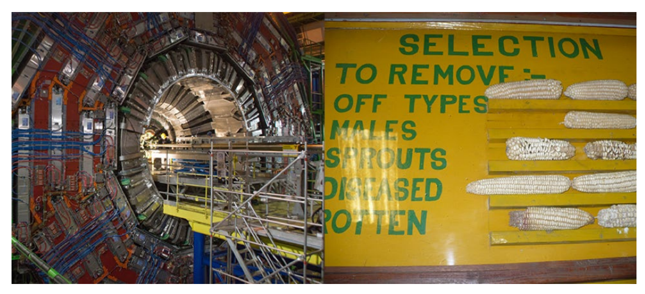
Figure 2. Science and technology advances through high-tech and low-tech innovation.

Our narratives must also pay attention to the remaking of social and technological configurations, drawing attention to the maintenance and repair of technologies and not simply their research and design. We might consider practices in the global south as well as the north, and among knowledge communities on the margins of society and culture, such as hackers and tinkerers. As self-evident as it seems, it is vital we tell stories which demonstrate that many different people may be innovators: women, citizen scientists, and the oppressed.