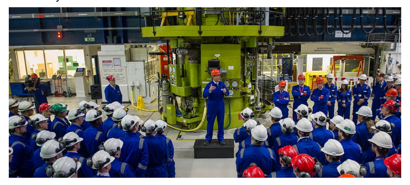
Figure 1. Networks of power: our infrastructures, political structures and economic structures of production are often deeply entangled. Here former UK Prime Minister David Cameron addresses

Scholars working in the fields of science, technology and society studies (STS) and the history of technology offer us concepts such as "socio-technical systems," "assemblages," "practices," "routines," and "scripts" with which to better gather the components of our stories. That is, the people, firms, organizations, sites, infrastructures, rules, institutions, technologies, and knowledges that are the subjects and objects—and very often heroes and villains—of our tales. Using these components, we can document what kind of alignments of knowledge, technology, and society produce better outcomes in terms of, for example, issues of poverty, climate change, or the distribution of power. We explain how these alignments are reproduced, by whom and by what processes and outcomes. And so our stories focus on the co-production of knowledge and the co-evolution of science, technology, firms, society , and sociotechnical systems and infrastructures .