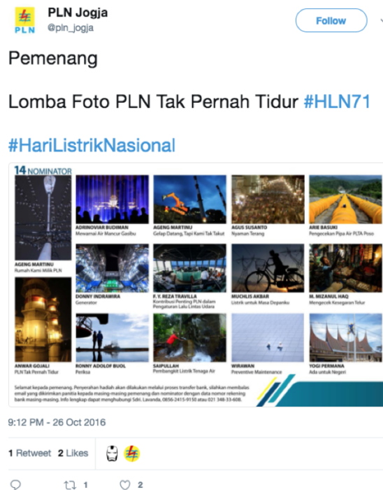
Figure 4. Tweet announcing 2016 Photo Contest

In October 2016, the electricity company held another photo contest with a theme “PLN Tidak Pernah Tidur” (PLN Never Sleeps). The 14 winning entries were tweeted by a PLN branch office in Jogjakarta (See figure 4).