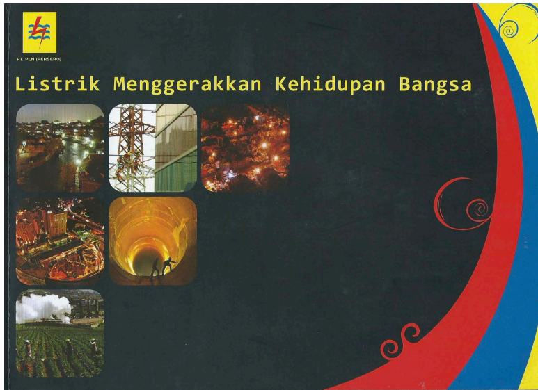
Figure 2. Photo Contest Prize booklet

PT PLN showcased some of the winning entries in a temporary exhibit at the Gandaria City Mall in Jakarta. 11 The company also published the 40 winning entries in a small book with the same title as the theme (See figure 2).