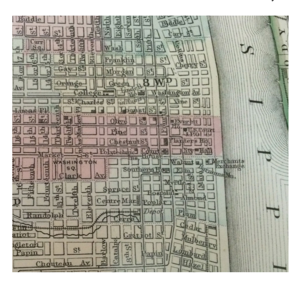
Figure 2 – Eads brought his bridge into the city at Washington Street, just two blocks south of Biddle. The tunnel took trains south and west, into Mill Creek Valley (at bottom) where the

By contrast, James Eads largely sidestepped downtown congestion with his tunnel which took all rail traffic to the south and west – into the Mill Creek Valley.